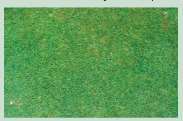
Headway G fungicide 4 lbs/1000 sq ft